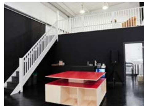
Dining area & Mezzanine